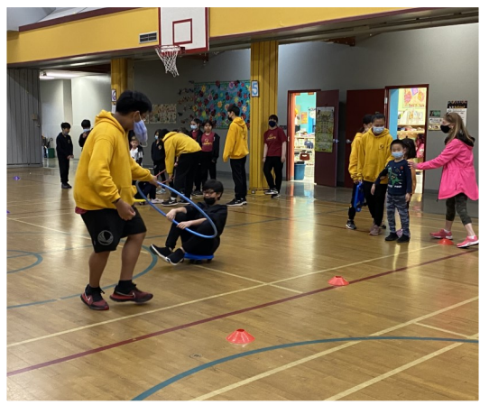
Fun Day games