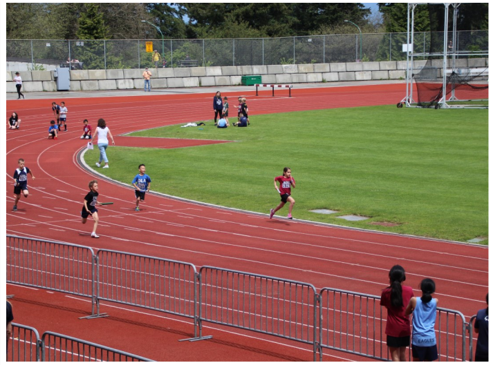
Grade 3 Mixed Relay