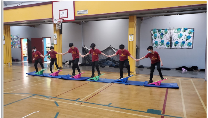
Grade 5's practicing balance