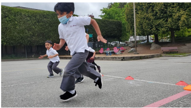
Kindergarten Start Line