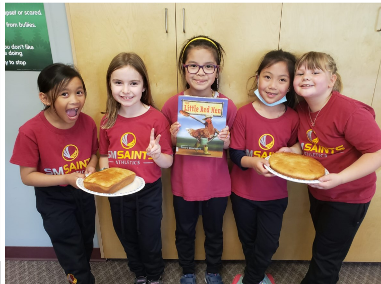
"Who will help me bake the bread?" "I will!" Said the twos!