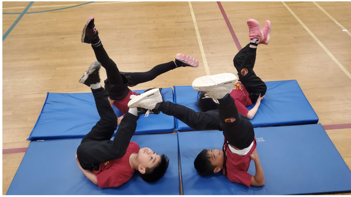
Grade 2's working on strength and balance with a partner