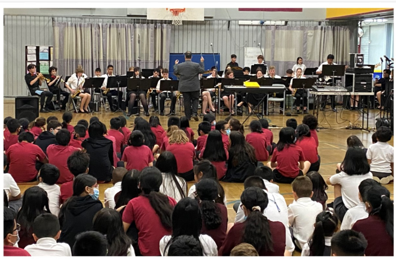
Enjoying performances from the St. Anne's Academy's jazz, concert choirs and band. They were touring from Kamloops.