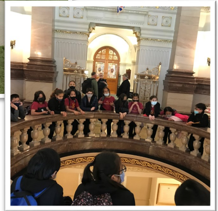
Grade 5 field trip to Victoria!