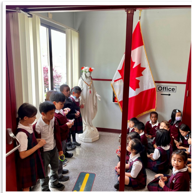
Gr. 1 saying a decade of the rosary during May

Available for FREE download at www.nashvilledominican.org Questions? VirtuesProgram@op-tn.org