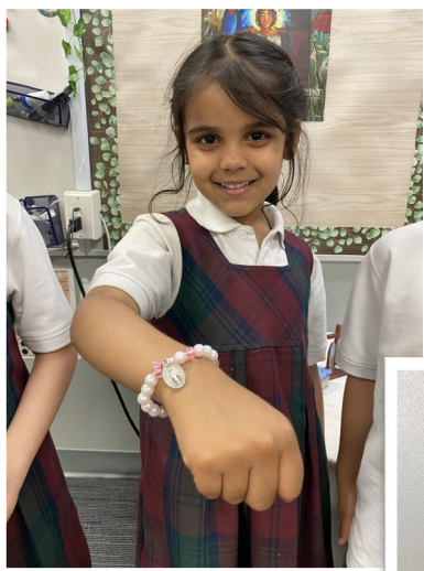
Kindergarten Rosary Bracelets